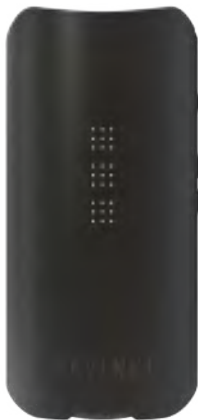
IQ2 shown in Smart Path 3